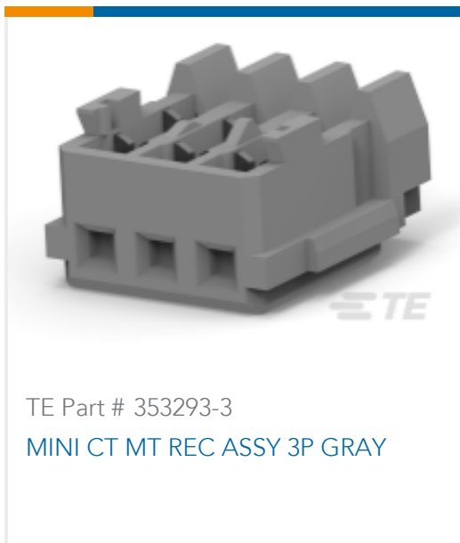
TE Part # 353293-3 MINI CT MT REC ASSY 3P GRAY