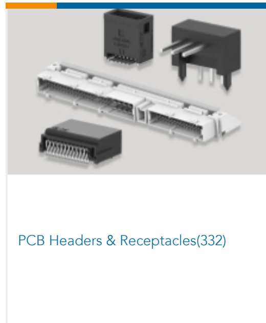
PCB Headers & Receptacles(332)