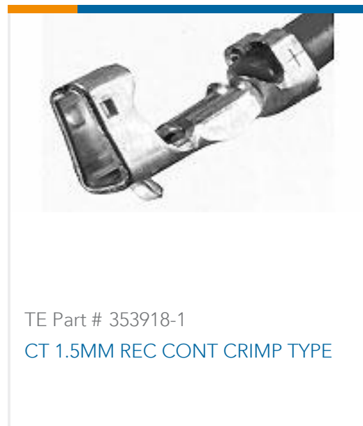
TE Part # 353918-1 CT 1.5MM REC CONT CRIMP TYPE