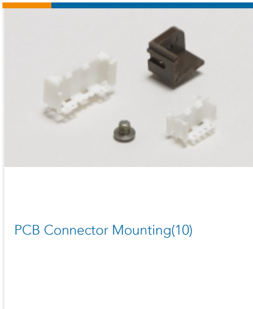
PCB Connector Mounting(10)